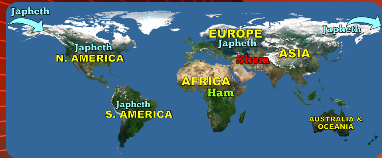
TABLE OF NATIONS Genesis 10