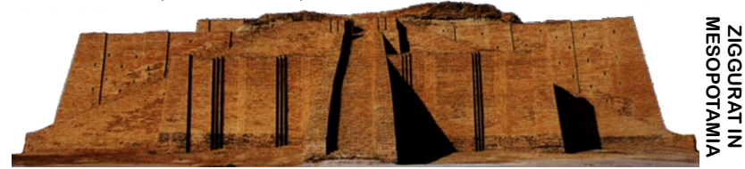
ZIGGURAT IN MESOPOTAMIA