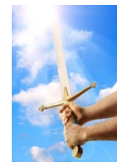
Captain of the Host of the LORD