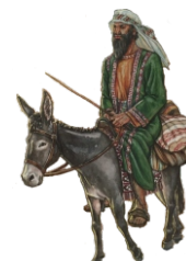
Balaam and the Angel in the Way