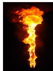
Pillar of Fire by Night