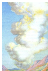
Pillar of Cloud by Day